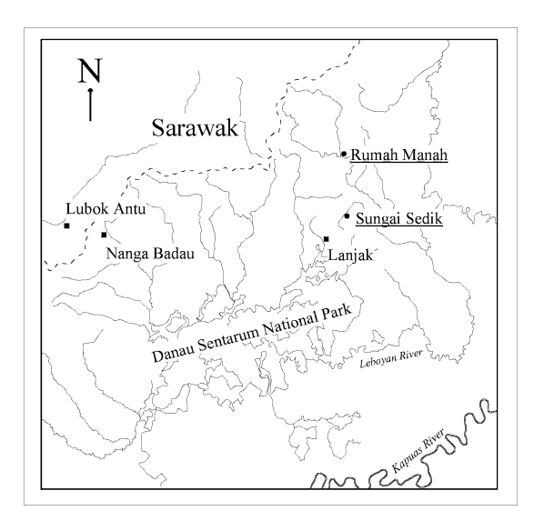
Figure 2. Study sites in West Kalimantan, Indonesia

The primary locations of field research were the longhouse communities of Rumah Manah (where Eilenberg focused), Sungai Sedik (where Wadley focused),4 and surrounding communities along the Leboyan River and northeastern edge of Danau Sentarum National Park, all in close proximity to the international border within the subdistrict of Batang Lupar (Fig. 2).5 The West Kalimantan Iban live primarily in five subdistricts along the international border within Kapuas Hulu District. The Iban in Batang Lupar Subdistrict make up the majority of the population at over 50% of 5216 people total (Kabupaten Kapuas Hulu, 2006). In 2006, Rumah Manah consisted of 10 nuclear families and approximately 100 people in all; Sungai Sedik held 19 households with over 130 people in total. The number of residents varies considerably throughout the year, and some months the in-residence population can be much smaller. There are several reasons for this: Many residents (especially young men) spend a certain amount of time every year working in Sarawak, Malaysia and older school-children stay most of the year in boarding schools as close as the subdistrict capital, Lanjak, or as far afield as the provincial capital, Pontianak, only visiting home on weekends and/or holidays.