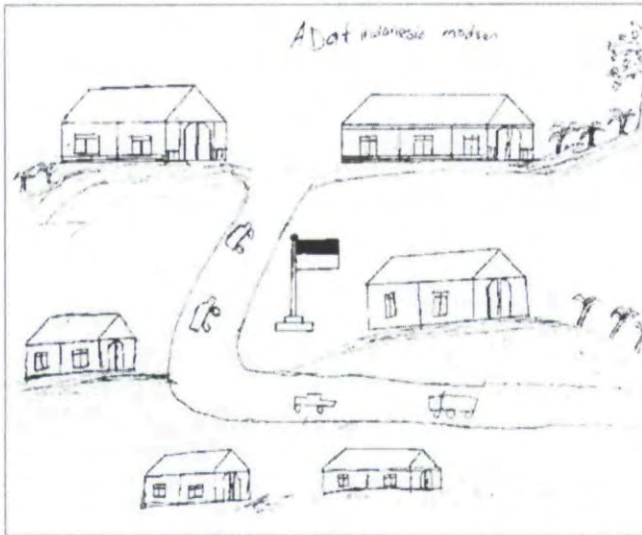
Drawing Illustrating an Iban Youth's Idea of Modern Indonesia

Another explicit aim of schooling I will discuss here is development ( pembangunan ). Indications of an equation between good citizenship, modernity, and development were constantly expressed in everyday teaching (see also Leigh 1999:44). Concepts such as 'progress' ( kemajuan ) and 'modern knowledge' ( pengetahuan modern ) were emphasized as the ultimate goals of a good citizen. Textbooks were full of pictures of the so-called modern Indonesian lifestyle, such as the middle-class family with a maximum of two children, living in single houses, having their supper sitting around a table, using a WC, etc., teachings which were very distant from the homelife experience of the students. There were, of course, no pictures of longhouse living in the textbooks and, although it is not expressed explicitly, communal longhouse living implicitly becomes inferior, because it does not mirror the image of a modern Indonesian citizen. I often heard teachers encourage their students to go home and enlighten their parents, and tell them what they had learned in school and try to get them to follow the informed instructions.