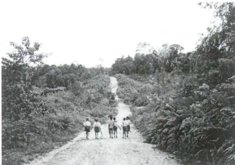
Iban Schoolchildren Journeying to School