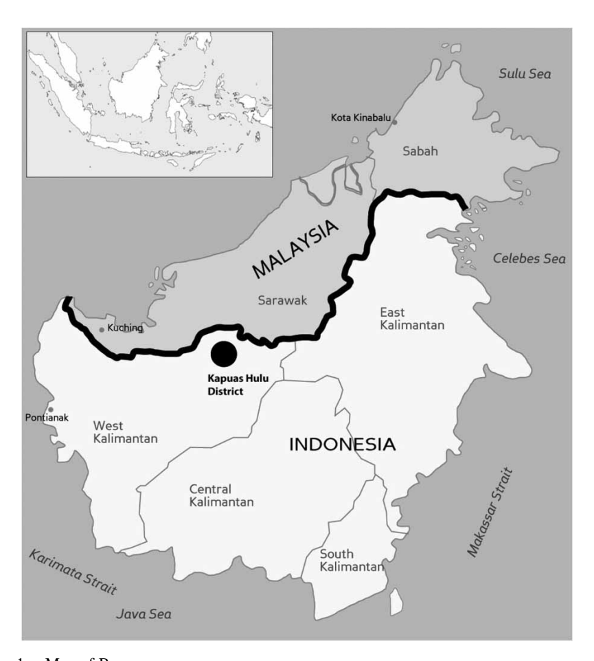
Figure 1. Map of Borneo.

Indonesian journalists who visited the remote West Kalimantan borderland in the heyday of illegal logging in 2004 wrote: