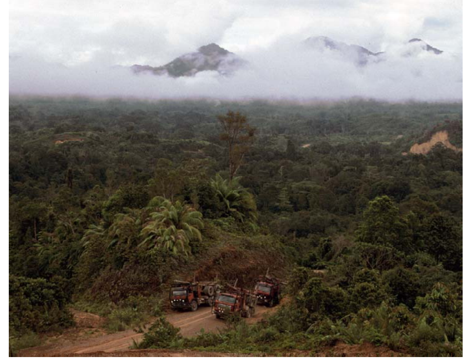
Photo 2. The borderland of West Kalimantan.

improved road network (originally justified by national security concerns) has facilitated such operations. For their part, local communities have viewed the forested areas along the border as their own traditional managed forest, and the harvest of that timber as the result of locally negotiated agreements. <sup>14</sup> So that their businesses would run smoothly, the timber entrepreneurs have bribed important district and subdistrict officials, including police, military, and immigration agents at the border, a fact widely known by local borderlanders.